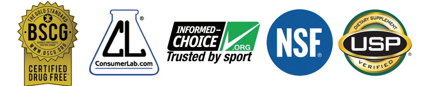
Figure 21-2. Examples of logos and seals from organizations that third-party verify/certify dietary supplements. Reproduced with permission from each.

Caffeine is the world's most widely consumed psychoactive substance. Previous research on caffeine has demonstrated positive effects on several military-